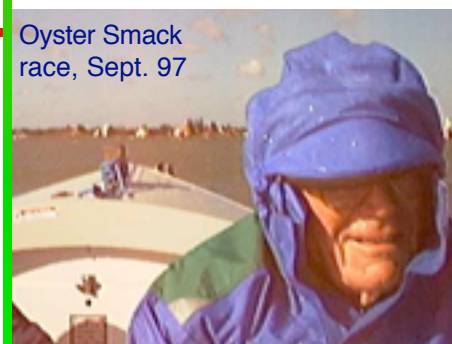
Oyster Smack race, Sept. 97

smacks in the distance, smile as broad as the day was long says it all really. G'ma was on board too and looking quite intrepid.